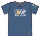
W1890 - Women's Crusher DWYL Dot